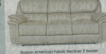
Boston American Fabric Recliner 3 Seater ₹69,000