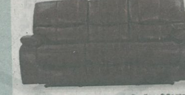
Passion Electric Leatherette Recliner 3 Seater ₹82,000