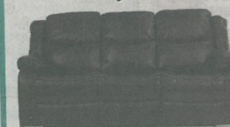
Rome Italian Leatherette Recliner 3 Seater ₹62,000