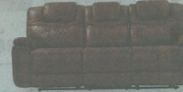
Texas American Leatherette Recliner 3 Seater ₹72,000