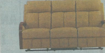
Morris Leather Recliner 3 Seater ₹86,000