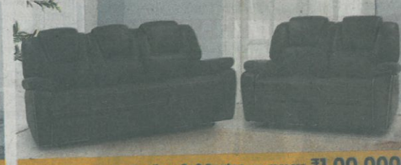
Travis Leatherette Recliner 3+2 Seater MRP : ₹2,52,000 ₹1,00,000