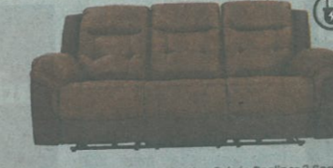
Atlanta American Power Motion Fabric Recliner 3 Seater ₹78,000