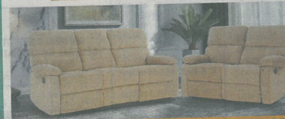
Kyle Fabric Recliner 3+2 Seater MRP : ₹160,000 ₹69,900

LARGEST RANGE OF INTERNATIONAL RECLINER COLLECTION IN THE CITY