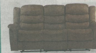
Miami American Fabric Recliner 3 seater ₹54,500