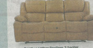
Bently Leather Recliner 3 Seater ₹97,000

MORE THAN 100+ RECLINER, 100+ SOFAS, 50+ BEDS, 75+ DINING SETS &amp; MANY MORE