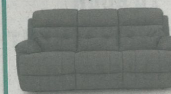
Johar Malaysian Leather Recliner 3 Seater ₹86,000