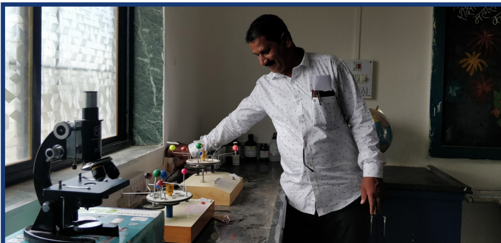
STEM Centre and Children Tinkering Lab at Zilla Parishad School, Pandherawadi, Kurkumbh, Maharashtra.