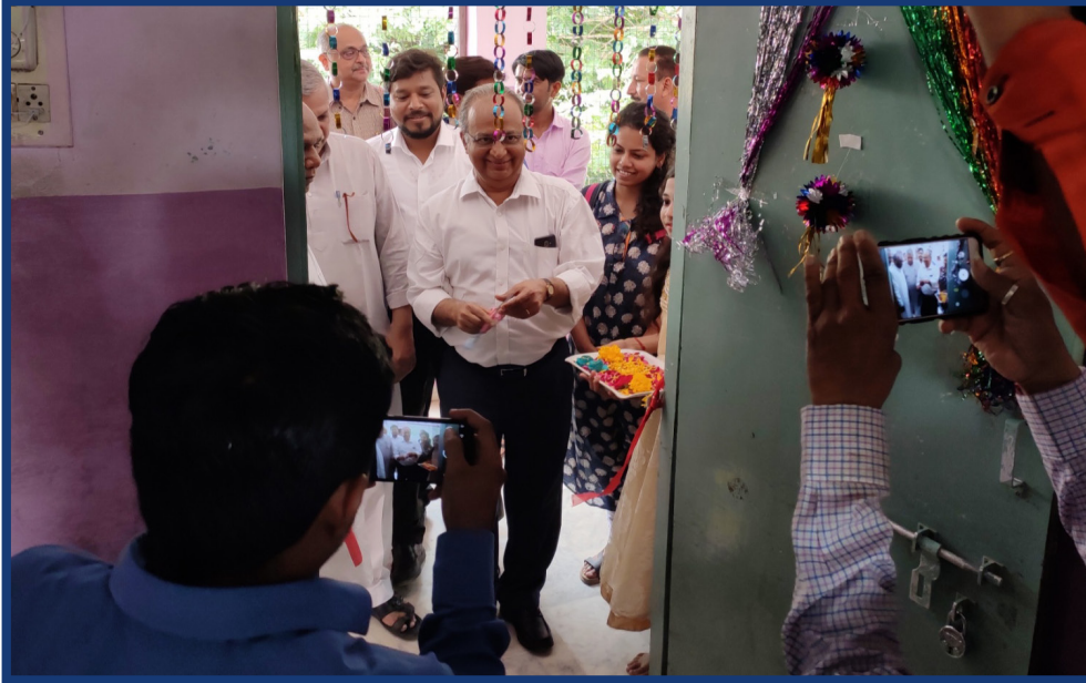
E-learning facilities at Janta Kewalramani School, Jambusar, Bharuch, Gujarat.