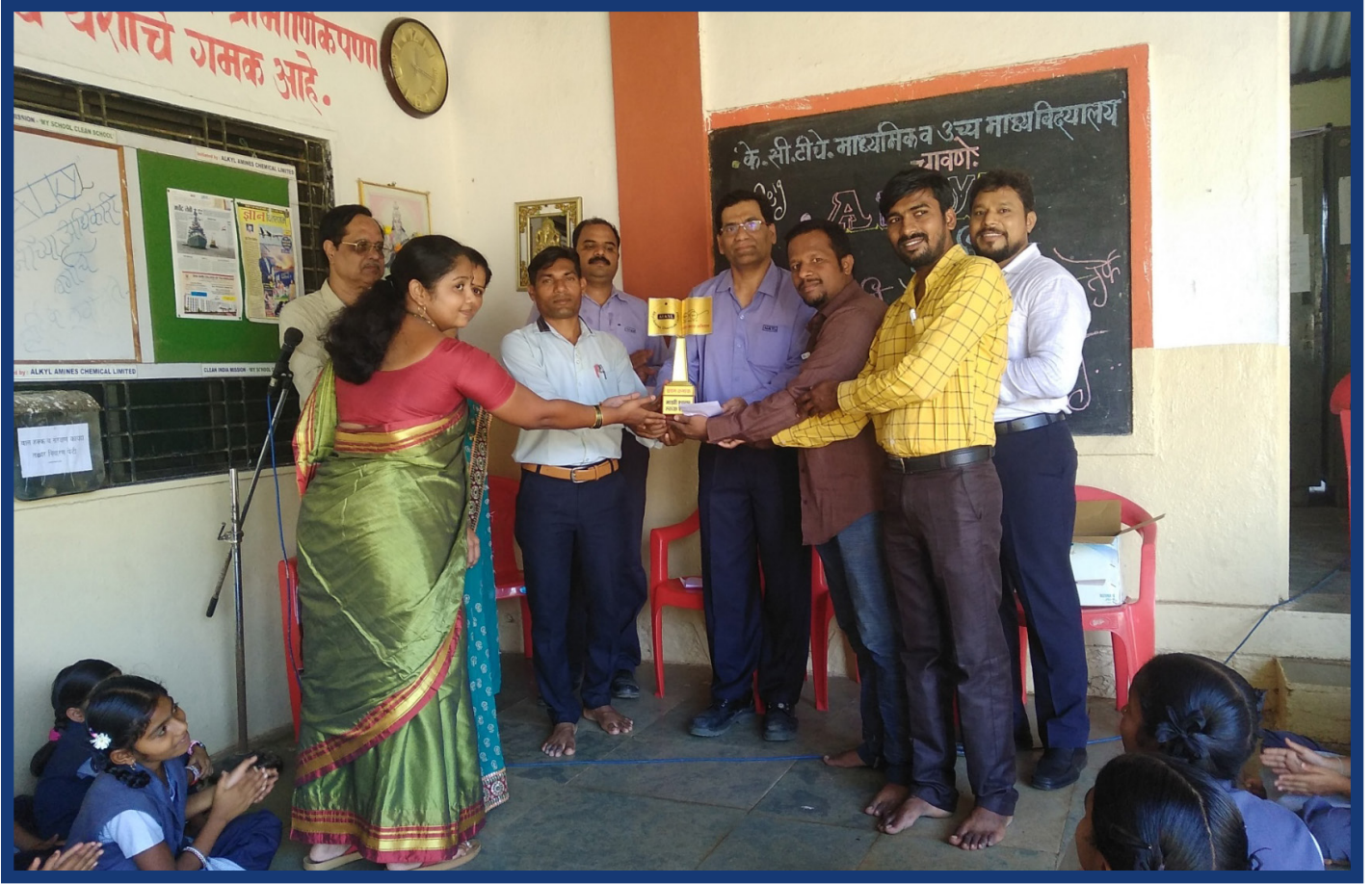
Swacch Bharat Abhiyan Drive at Patalganga, Maharashtra.