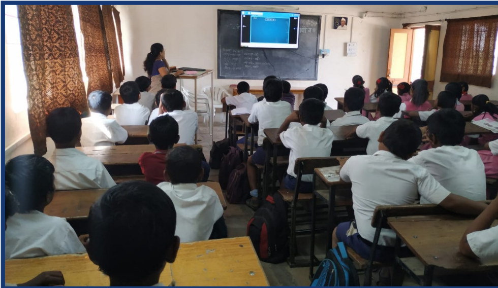
E-learning facilities at Punyashlok Ahilyabai Holkar Secondary School, Loni, Maharashtra.