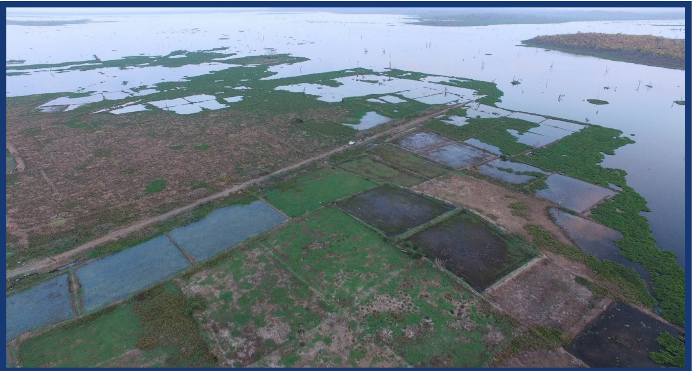
Support to Sanctuary Nature Foundation for Rewilding Project at Gothangaon, Nagpur, Maharashtra.